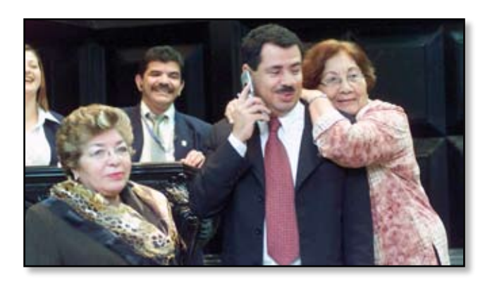
MP's celebrate passage of legislation

The legislation requiring compulsory seat belt use for both drivers and passengers is approved in the second debate.