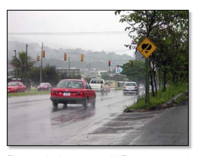
The campaign is supported with TV, newspaper and roadside advertising