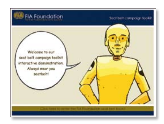
Seat belt toolkit interactive demonstration