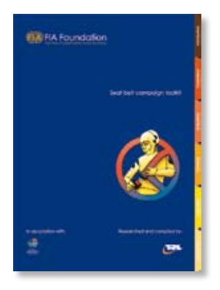
FIA Foundation seat belt toolkit