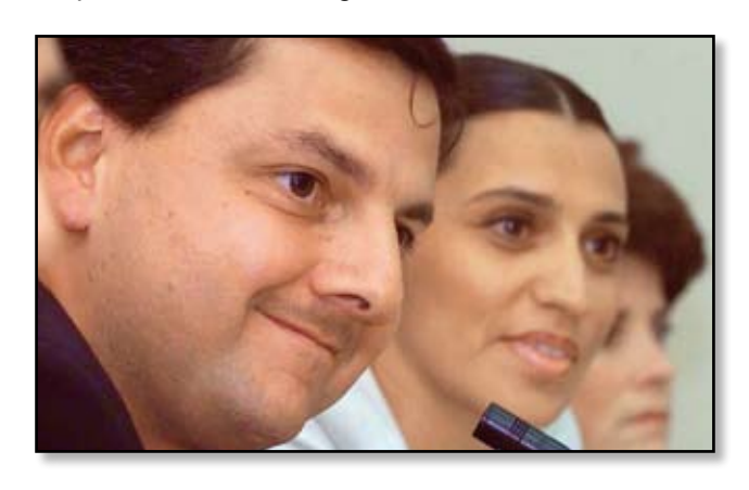
Transport Ministers Javier Chavez and Karla Gonzalez at a campaign press conference

At 11.44 p.m., article 79 on compulsory seat belt legislation is approved with 43 votes in favour and five votes against. Also approved is article 137. The second vote is scheduled after the Parliament returns from recess on 19th January. The Transport Minister declares to the press that even if this first vote is only the first step to legislation, it arrives just in time for the holiday season when the road toll is highest. The positive legislative developments, informative traffic police actions and the ongoing media campaign will help the habit of wearing a seat belt to take hold.