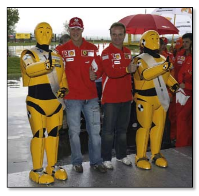
The FIA Foundation crash test dummy has become a global road safety icon