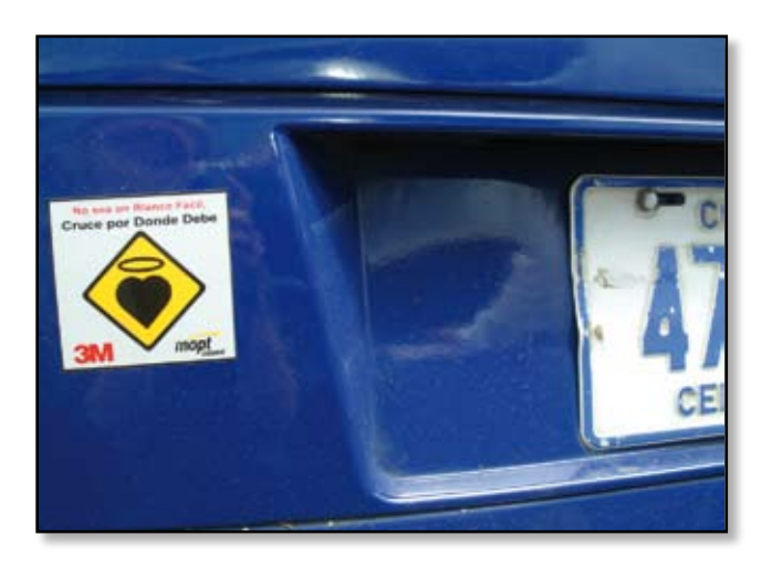
Private funding and support was attracted by the campaign's success